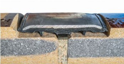
Joint type 1