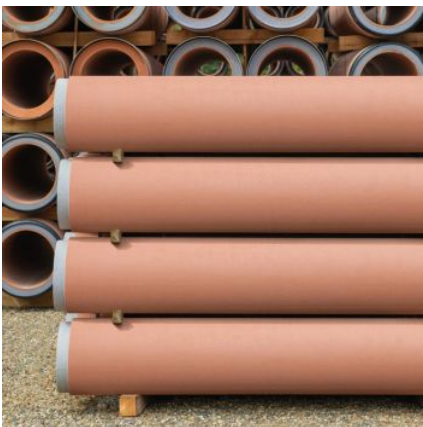
KERA.Drive packaging unit - DN 200 - DN 300